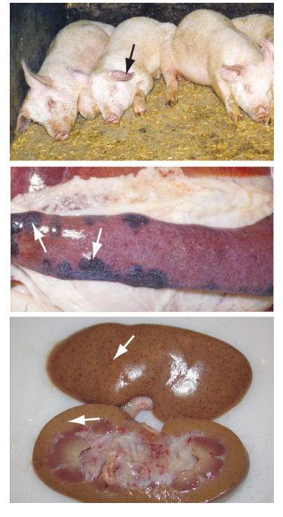
Figure 1: CSFV causes a severe disease in pigs, with lameness and haemorrhages (top panel, arrow, outbreak Switzerland 1993), infarcts in the spleen (middle panel, arrows) and petechial bleedings in the kidney (bottom panel, arrows).

Recent advances in understanding the interaction of CSFV with the host led to a model for the pathogenesis of CSF, in which a specific role for different cells of the immune system was postulated (McCullough K. C. et al., 2009). After transmission via the oronasal route through direct contact or feeding of contaminated swill, the virus is found in the tonsils and